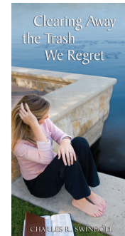
Clearing Away the Trash We Regret by Charles R. Swindoll booklet

For related resources, please call USA 1-800-772-8888 • AUSTRALIA +61 3 9762 6613 • CANADA 1-800-663-7639 • UK 0800 787 9364